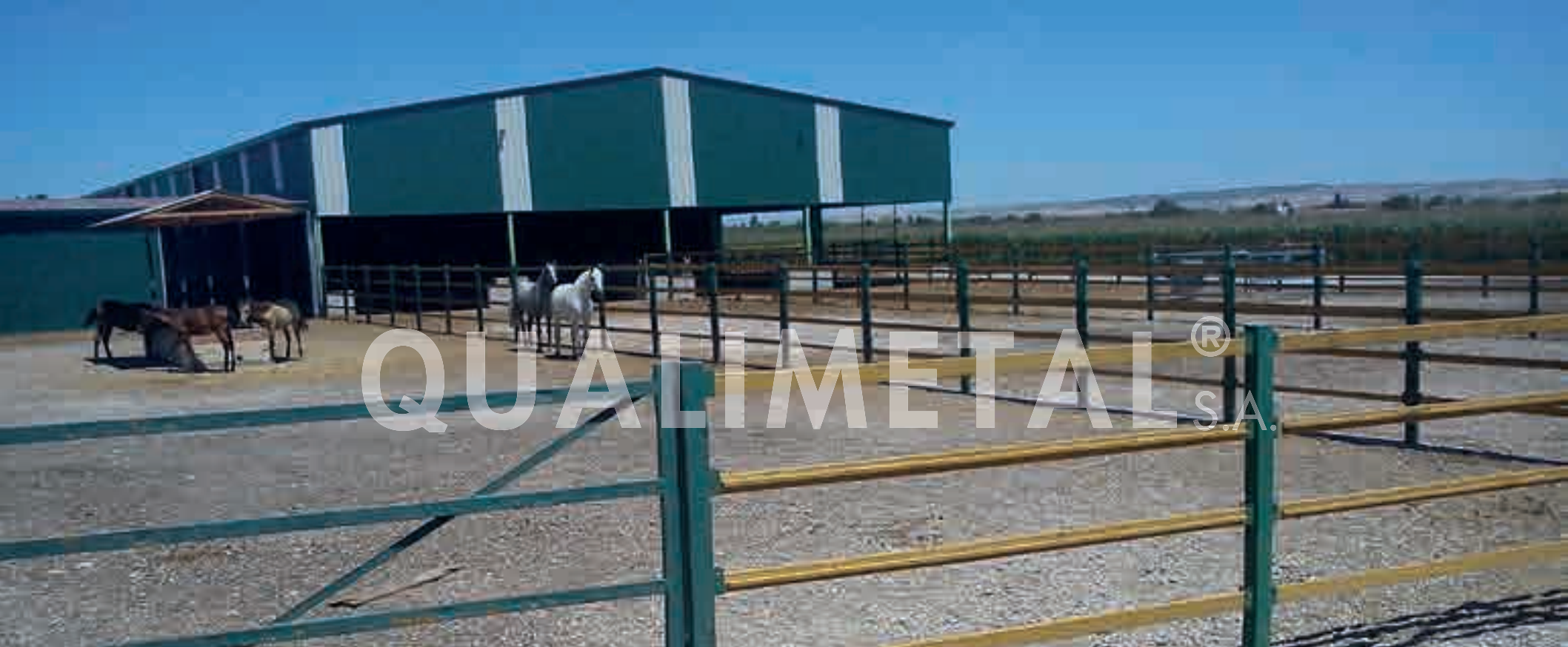
Sports and equestrian centres adapted to each requirement for building use.