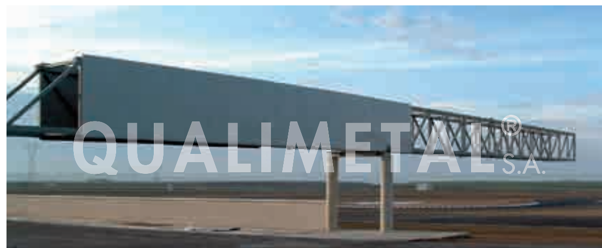
SPECIAL STRUCTURES for large cantilevers.