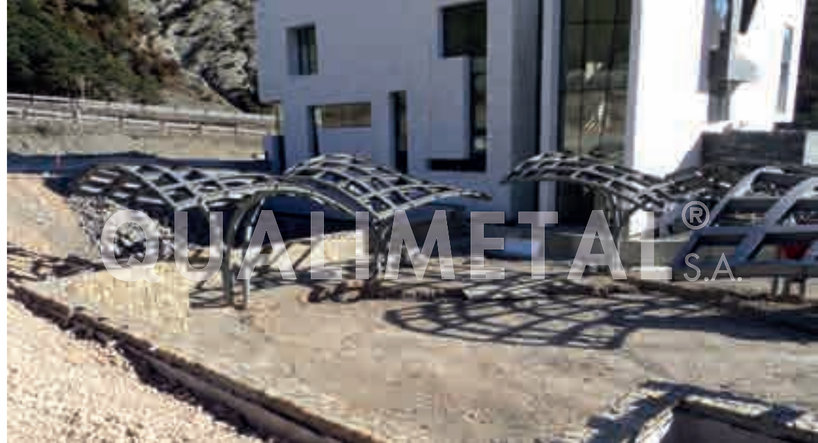
SHELTERS specially designed for car parks.