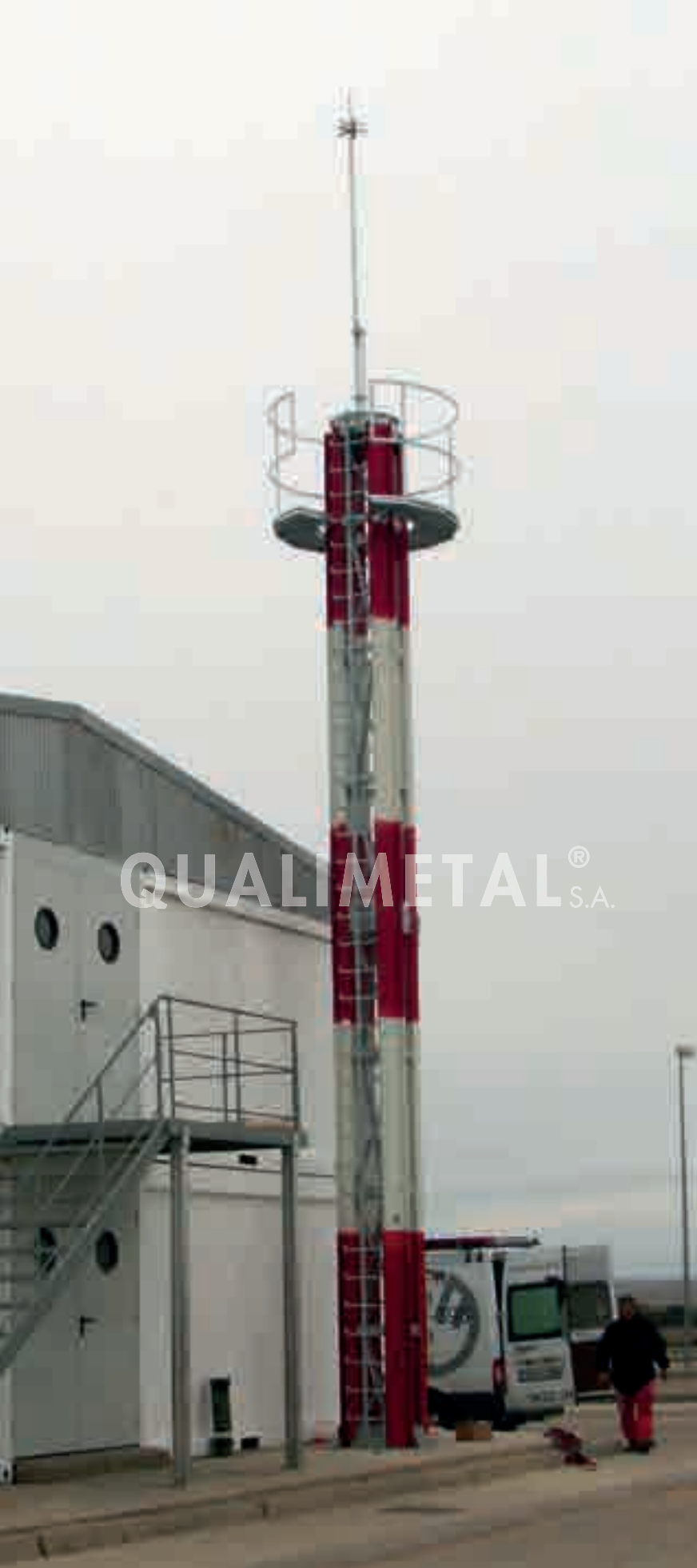
TELECOMMUNICATIONS TOWERS officially approved to a height of 30 metres, including provision of lightning protection.