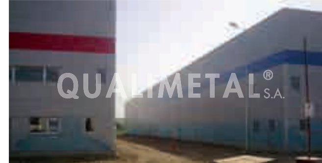
For speed of execution and excellent finishes, QUALIMETAL S.A. is the industry leader.