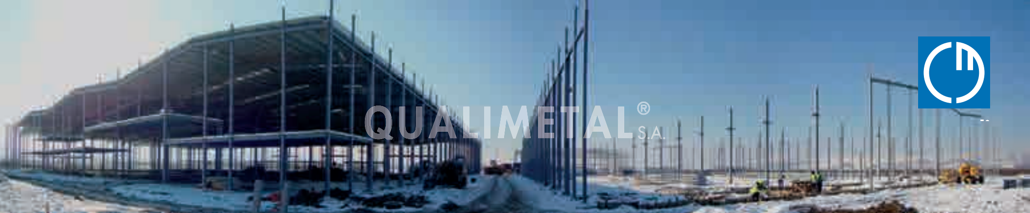
Construction of an industrial park with a surface area of 16,000 m 2 in Romania.