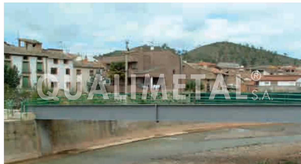
ROAD BRIDGES and FOOTBRIDGES .